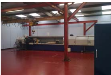
The New Laser Room

In addition to the new laser, the company has also introduced new engraving technology, E-Flo. E-Flo is a unique cell structure and combined with an improved cell angle profile that will provide a more consistent and increased ink lay down. This unique cell angle profile now allows printers to work with the expanded color gametes in particular high definition or Opaltone technology without concern of the angles clashing with the printing plate.